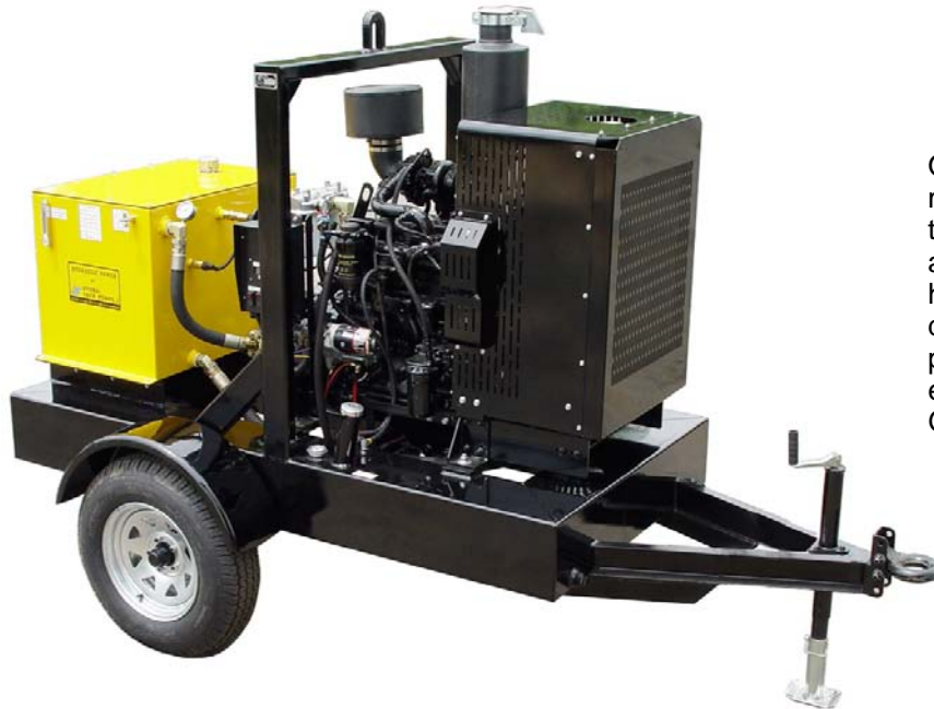
Unit shown with optional highway trailer

Our high performance 100 H.P. model features a John Deere turbocharged 4 cylinder diesel and pressure compensated hydraulic pump. It is designed to drive our larger submersible pumps or other hydraulic equipment requiring flows to 53 GPM and pressures to 2500 PSI.