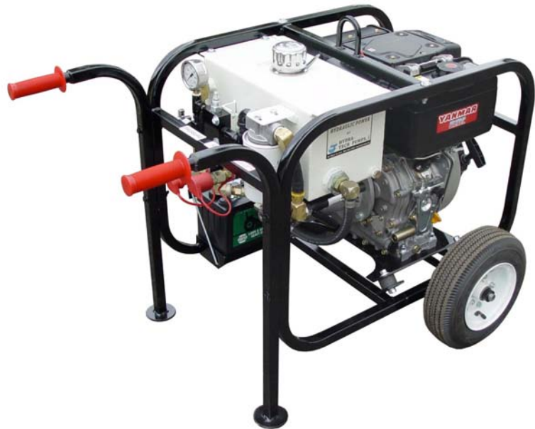
Unit shown with optional wheel kit

This portable diesel power pack is ideal for driving our 3" trash pumps and even our 6" high-volume propeller pump. It also can provide hydraulic power to run many other hydraulic tools now available.