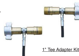
1" Tee Adapter Kit

1/2" kit Part# 5505030 3/4" kit Part# 5505031 1" kit Part# 5505052